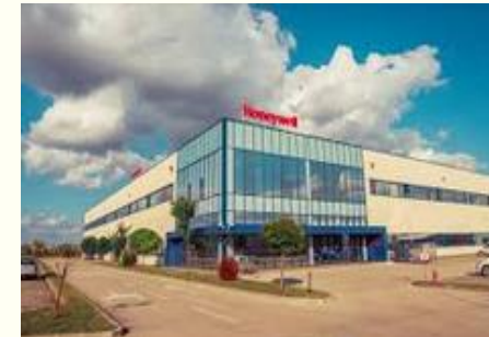
Timisoara Industrial Park