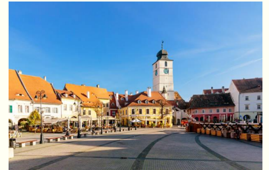
Small Square in Sibiu