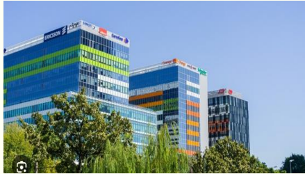
Bucharest Multinational Companies