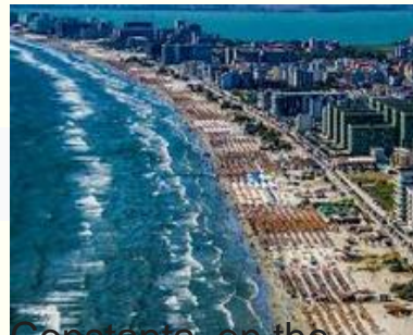
Constanta, on the shores of the Black Sea