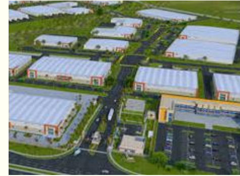
Iasi Industrial Park