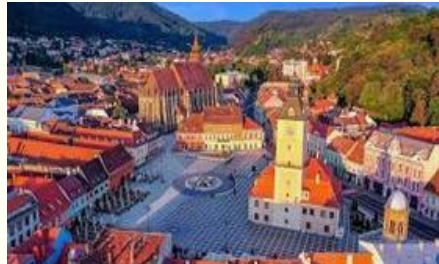
Tourism in Brasov Summer and Winter