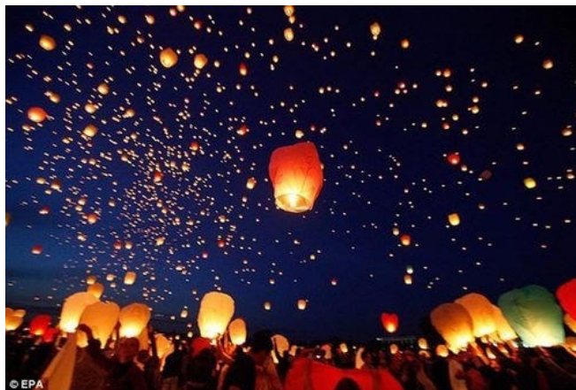
Popular Saints Parties