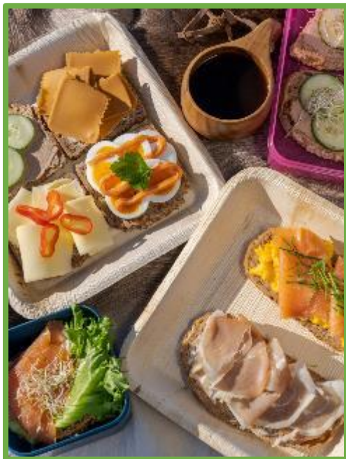
Visit Norway, 2023