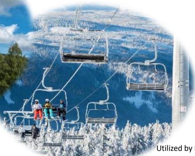
Utilized by Lillehammer, n.d.