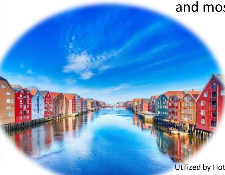
Utilized by Hotels.com, n. d.