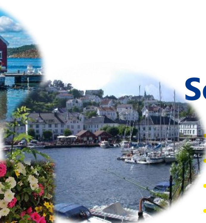
Visit Norway, 2023