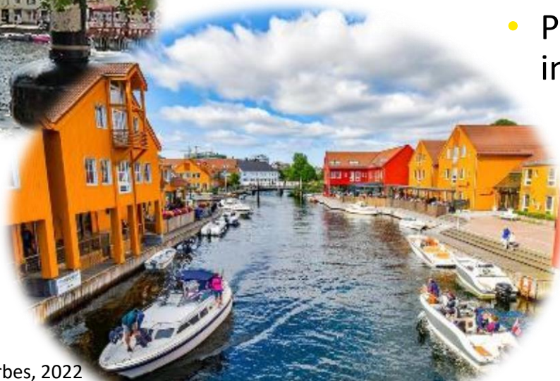
Nikel, Forbes, 2022