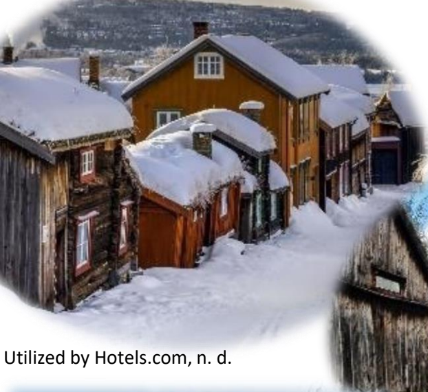
Utilized by Hotels.com, n. d.