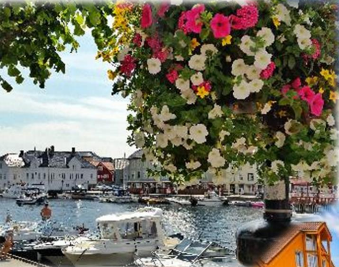
Visit Norway, 2023