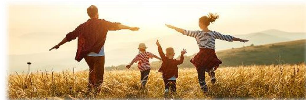
Norges institusjon for menneskerettigheter, 2023