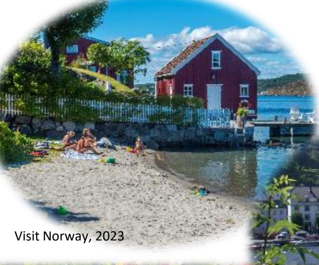
Visit Norway, 2023