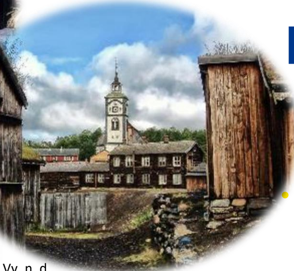
Vy, n. d.