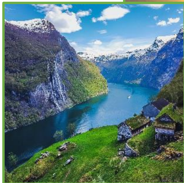
Nicola Montaldo, utilized by Fjord Tours, 2023