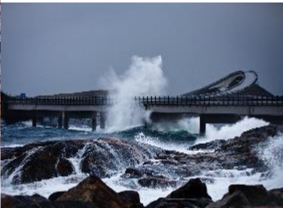
Visit Norway, 2023