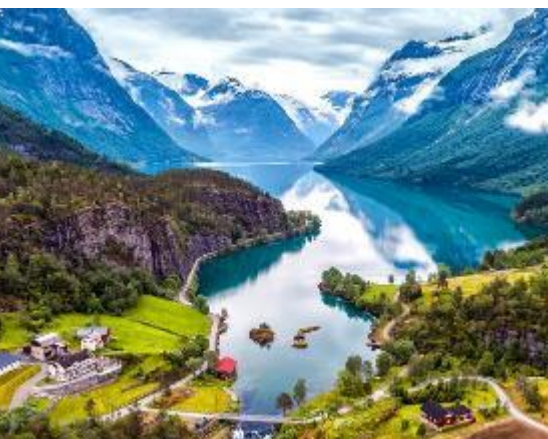
Kayak, n. d.