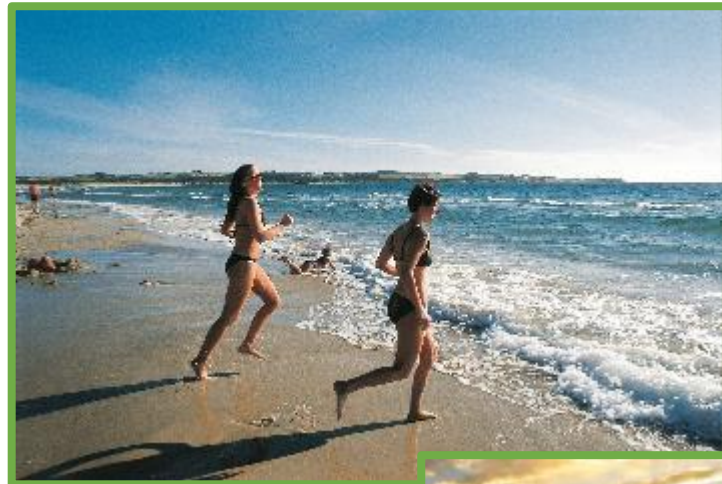
Linns reise, 2016