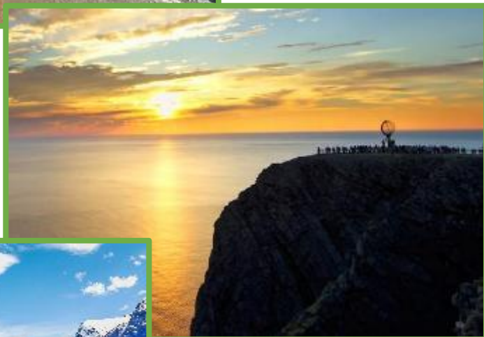
Visit Norway, 2023