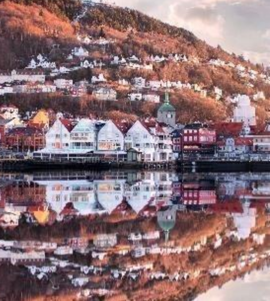
Visit Norway, 2023