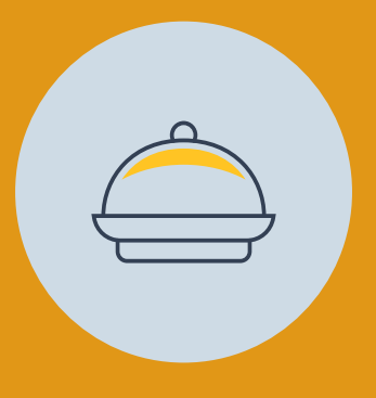
10% Discount on Food for family occasions (groups of 30 or more)